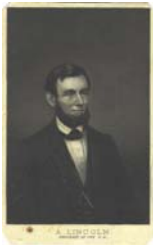
LIHO 7328 - Lincoln Portrait from Cooper Union