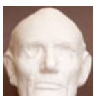
LIHO 6723 – head