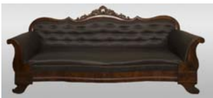
LIHO 1059 – Settee from Lincoln Home

LIHO 5412 – Photograph of rally at Lincoln Home