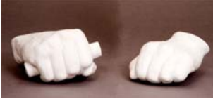
LIHO 6724 – right hand LIHO 6725 – left hand