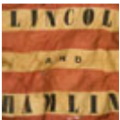
LIHO 7259 – 1860 Campaign Banner