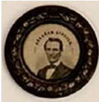
LIHO 6768 – Commemorative Token from 1860 Election