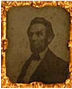
LIHO 6767 – Commemorative Token from 1864 Election